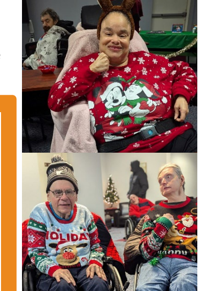
Folks from Lydia and English houses dressed in their ugly sweaters at the Holiday Party!