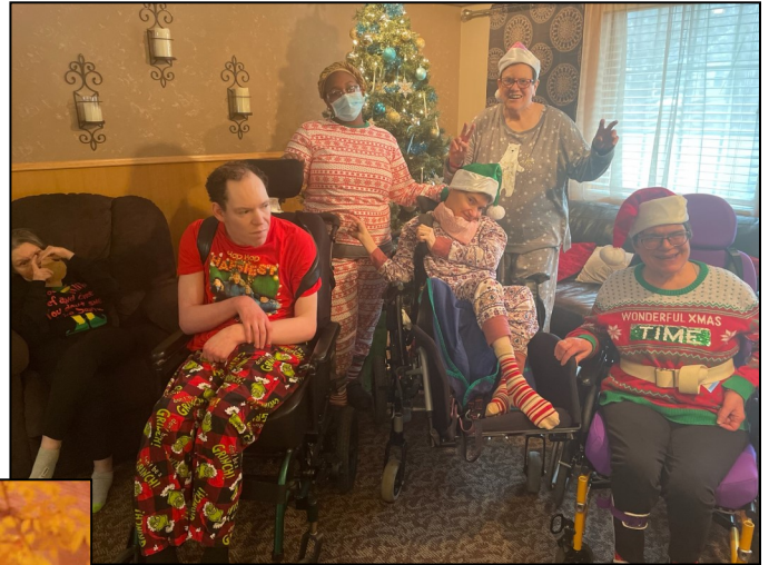
Newport House loves celebrating the holidays!

From All of Us Here at The Phoenix Residence, Inc.